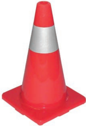
Figure 7. Safety (“face”) cone exhibit shown to jury

substantial factor. I also showed this safety cone to the jury (Figure 7):