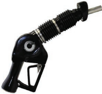
Figure 4. Gas pump handle exhibit at trial

occurrences at gas stations. We used some of their documentation to make that point (Figure 5):